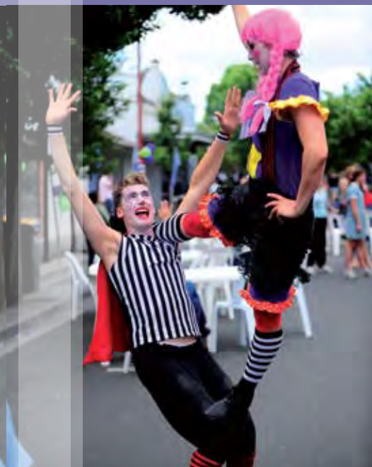
Photo: Some of the magic at Mont Albert Fair

Just take a pinch of fine weather, a dollop of community involvement, an eclectic band of small businesses, a dash of free interactive children's entertainment, welcoming food, all mixed together by a strong service club and you have all the ingredients for the magic of Mont Albert Fair in Hamilton Street, Mont Albert.