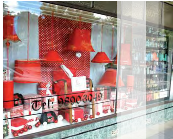
Photo: Runners-up, Churchills for Hair, festive window display.