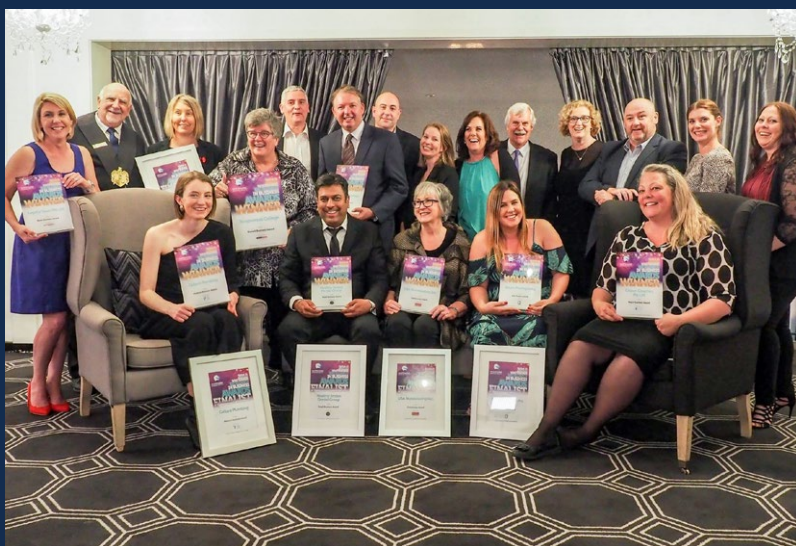
2018 Whitehorse Excellence in Business Award Winners

The awards invite organisations to stand out from the competition, to recognise staff for their contributions and proudly exhibit their successes.