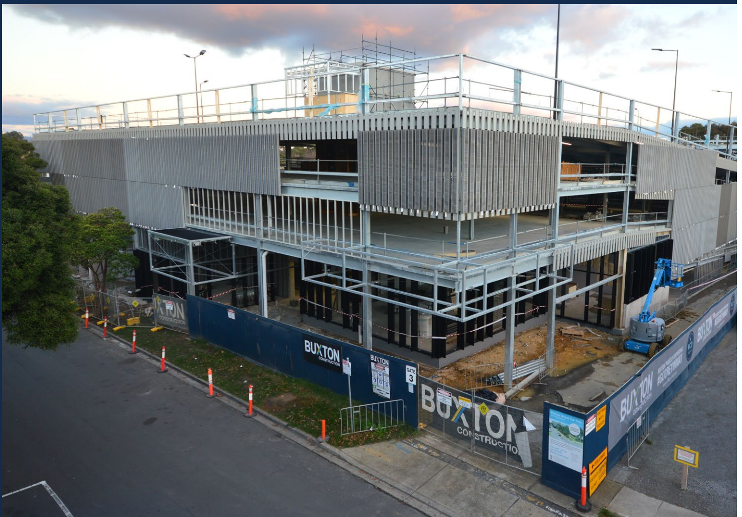
Harrow Street Carpark construction

For more information, visit whitehorse.vic.gov.au