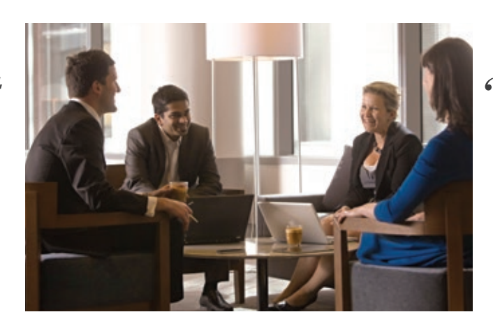
I would like to commend the Council and Deakin for providing a professionally run program with excellent student participation 99 Industelec